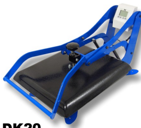
DK20 16" x 20" (41 x 51 cm) Digital Clamshell