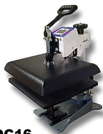
DC16 14" x 16" (36 x 41 cm) Digital Combo