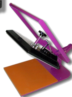
JetPress 14 12" x 14" (30 x 36cm) Clamshell