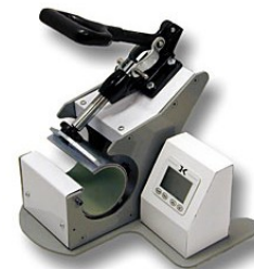
DK3 Digital Mug Press