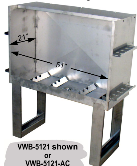
VWB-5121 shown or VWB-5121-AC

VWB-5121 fits (1) 47" x 31" screen or (2) 23" x 31" screens at once!